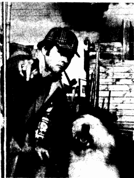
SHERLOCK & PACO ON THE SCENT