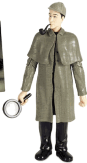
Sherlock Holmes action figure sold by Shakespeare's Den for $9.95. See www.shakespearesden.com

(cont. from page 2) of the Tuvan Delegate , is a long short story that involves additional Sherlockian characters, Mycroft Holmes and Professor Moriarty. Take one peace conference in London, add the Professor causing trouble, mix in Mycroft trying to keep order, Sherlock investigating an apparently unrelated event and stir well. The result is written here. This is an amusing tale, full of action and adventure, with little deduction and not much mystery.