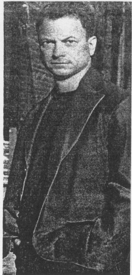
Actor Gary Sinise (CSI: New York) In a recent interview: "What makes CSI such a powerful TV franchise?" "The stylishness of the show; the writing, the cast and the Sherlock Holmes element. As a kid, I was a Holmes fan. I wanted to know what makes the puzzle work. People are fascinated by the small details."