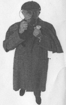
FROM AN ARTICLE ABOUT D.C.'S SPY MUSEUM, TITLED CAPITAL GAINS IN THE 2002 NOV/DEC ISSUE OF AAA'S "GOING PLACES"