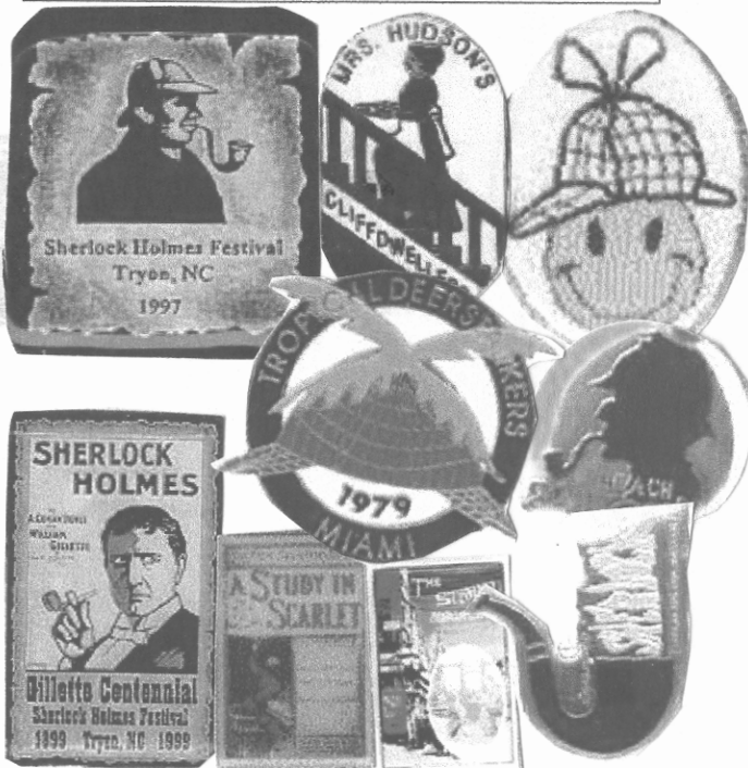
From an article in February, 2000 Discover magazine.