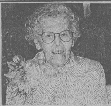
← Recently honored P.P. o'F'er!

I keep six honest serving men (They taught me all I knew); Their names are What and Why and When And How and Where and Who.