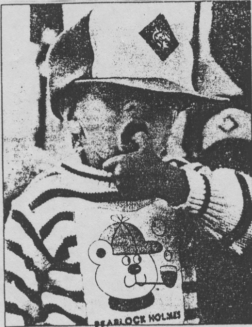
WORKING ON HIS "ENGINEER'S" THUMB. ☺